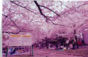
Nagai Botanical Garden