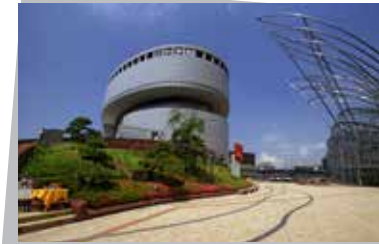
Osaka Science Museum