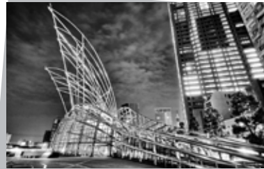
National Museum of Art