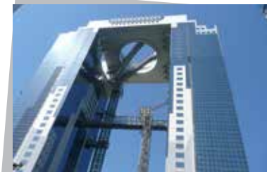
Umeda Sky Building