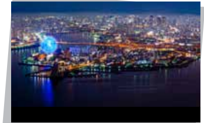
Tempozan Ferris Wheel