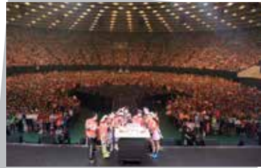
Osaka Jo Hall