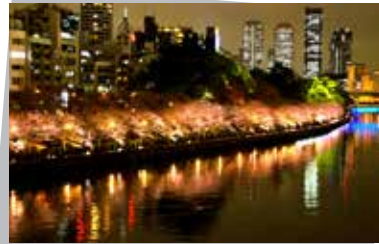
Minami Temma Park