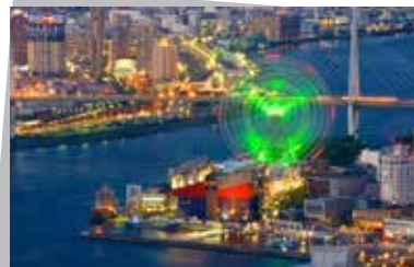
Tempozan Ferris Wheel